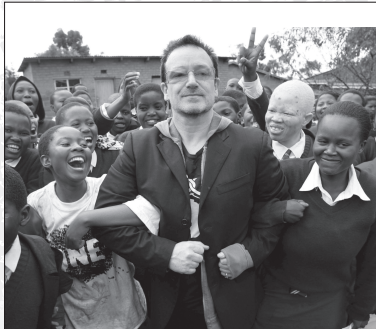
Bono sees it as simply doing the right thing...

Bono was first moved by starvation in Ethiopia, but he quickly realized the vast needs of the entire African continent. He learned that much of the population was impacted by AIDS, a disease that affects the immune system so that even a cold can lead to death. In Africa, where medical care is often meager, that means massive death tolls. "The facts about AIDS blow your mind," he says. "They also break your heart."